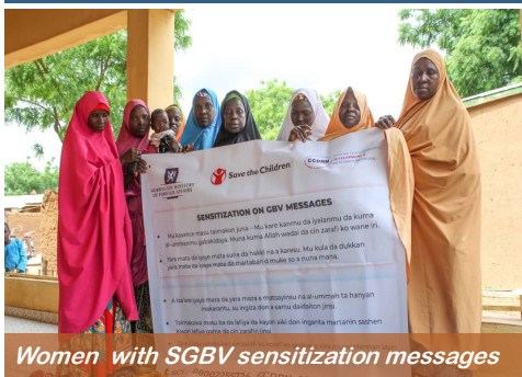
Women with SGBV sensitization messages