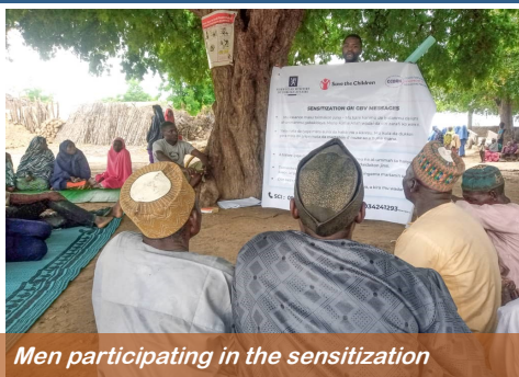
Men participating in the sensitization