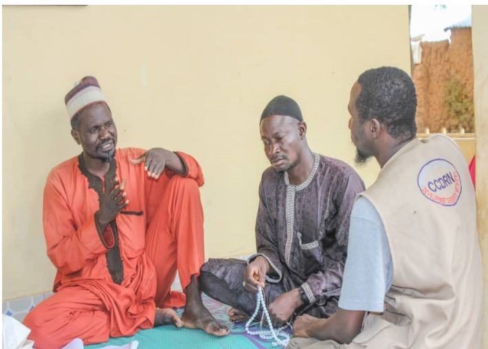
GBV sensitization going on in Fika LGA