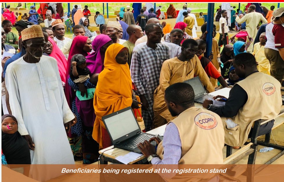
Beneficiaries being registered at the registration stand

In continued efforts to bring about succor and relief to communities affected by conflicts by helping them build resilience, the Centre for Community Development and Research Network (CCDRN) has successfully finished the scoping of beneficiaries who will benefit from the Resilience and Social Cohesion (Peace) in Northeast Nigeria project funded by the German Government BMZ.