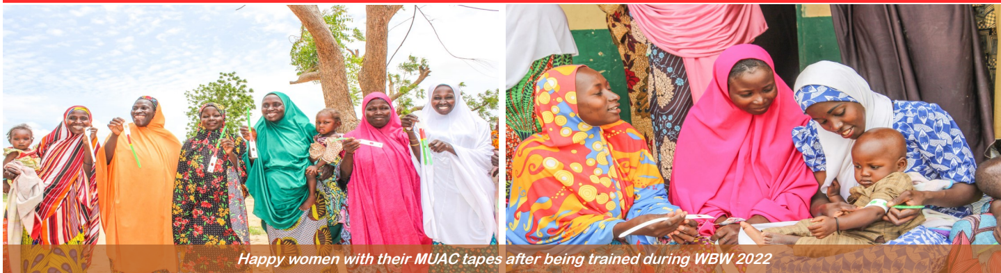
Happy women with their MUAC tapes after being trained during WBW 2022

To commemorate the World Breastfeeding Week (WBW) of 2022, the Centre for Community Development and Research Network (CCDRN) conducted a sensitization on Family MUAC approach, distribution of MUAC tapes, and the training of 600 caregivers on MUAC screening and Referral processes in Yobe state.