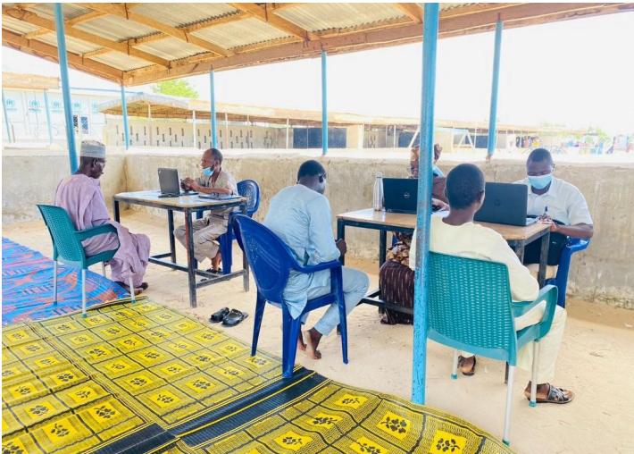
BMZ scope registration going on in Bade LGA