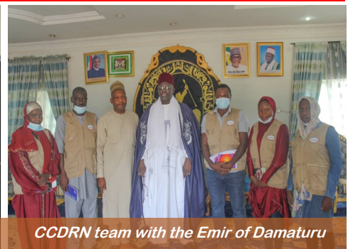
CCDRN team with the Emir of Damaturu

In continuous effort to preventing the spread of COVID – 19 among women and girls especially in conflict affected communities of the Northeast Nigeria, the Centre for Community Development and Research Network (CCDRN) with support from United Nations Women will be rolling in a COVID – 19 awareness and response project in Bade, Damaturu and Potiskum Local governments of Yobe state.