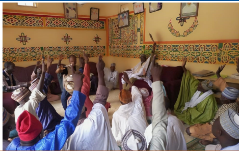
CTC formation at Sindimina