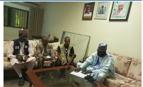
Team with Special Adviser to the Governor

With the aim of strengthening food systems to promote increased value chain employment opportunities for youths in Nigeria, the Centre for Community Development and Research Network (CCDRN) will be implementing a livelihood project in Birnin Kudu and Mallam Madori local governments of Jigawa state where 8,000 people are to benefit from it.