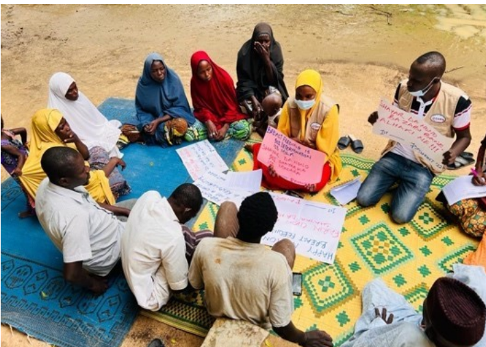
Sensitization going on during the world breastfeeding week