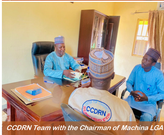
CCDRN Team with the Chairman of Machina LGA