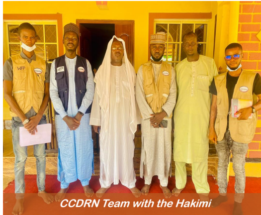
CCDRN Team with the Hakimi

These beneficiaries will be drawn from 10 communities. This will go a long way in helping these people/communities to improve nutrition and build resilience.