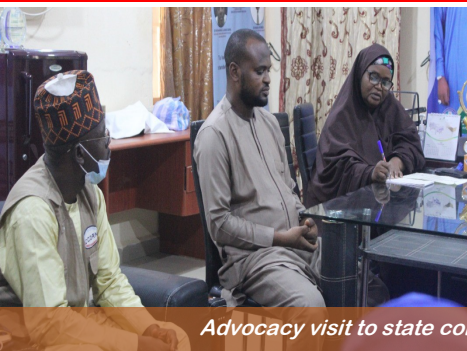
Advocacy visit to state commissioner of health