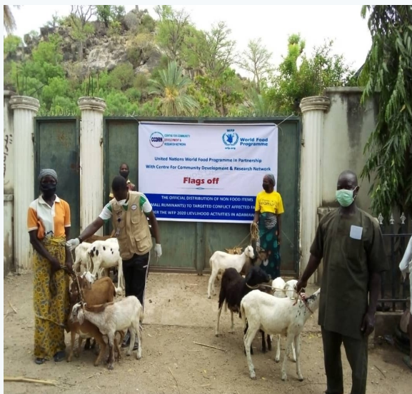
Beneficiaries display small ruminants received from CCDRN thanks to WFP in Michika, Adamawa

services, immediate feeding for the livestock and other ancillary support. To make this process sustainable, CCDRN further ensured that goats and sheep that meet specifications of good health and breeding performance are distributed to the beneficiaries. Each of the 450 targeted beneficiaries received a total of four goats/sheep comprising a male and three female. This is expected to strengthen resilience of communities from the loss of livestock assets