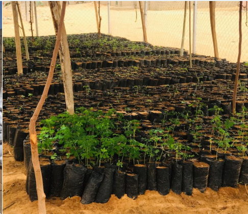
CCDRN tree nursery ready for planting in Bade Communities