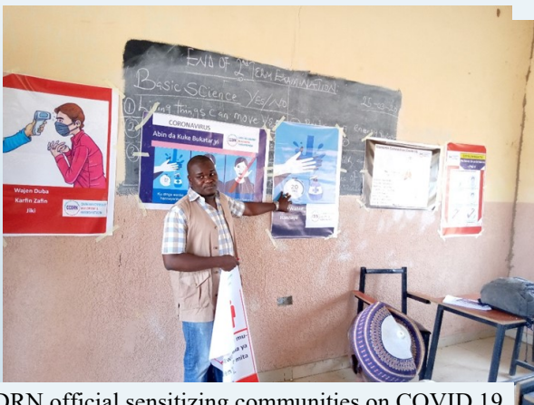
CCDRN official sensitizing communities on COVID 19 preventive measures in Borno communities