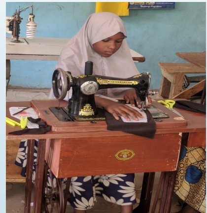
WFP tailoring beneficiary sewing Face mask in Bade