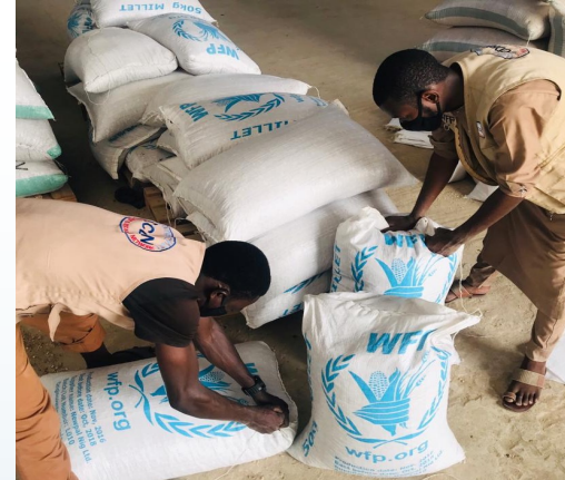
CCDRN team sorting seeds meant for distribution to rain fed farmers in Bade