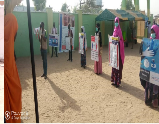
CCDRN sensitizing community members on COVID 19