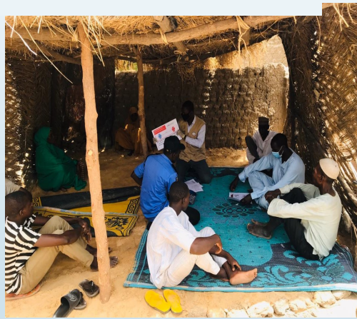
COVID 19 FGD being conducted by CCDRN in Bade