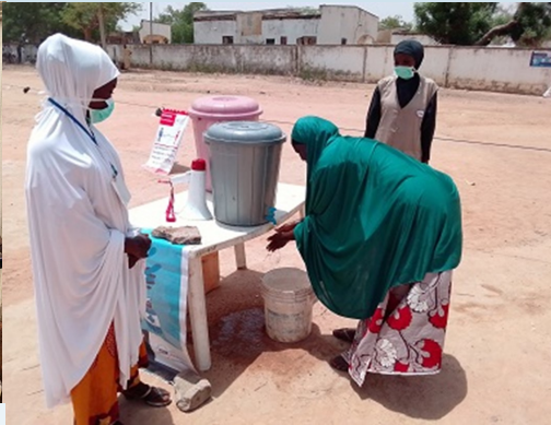
Hand washing point at CCDRN project site