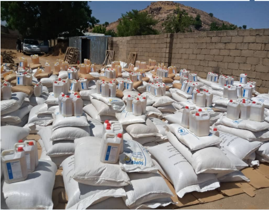
WFP food items in full display ahead of distribution To livelihood beneficiaries in Madagali