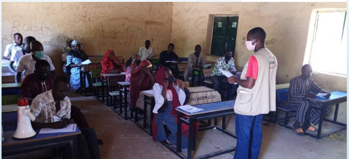
Beneficiaries receiving training on rain fed farming in Michika, Adamawa state

The distribution of fertilizer and other input to beneficiaries is set to commence soon