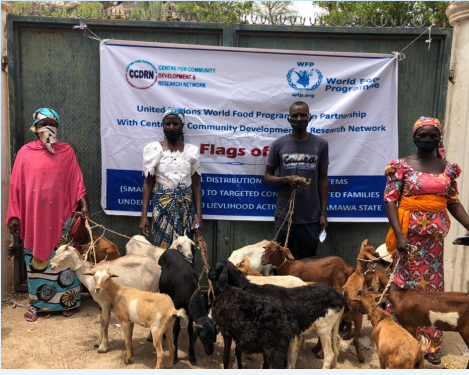
Beneficiaries displaying goats and sheep Received from CCDRN in Madagali