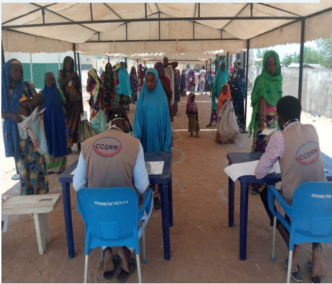
CCDRN team verifying beneficiaries prior to food distribution