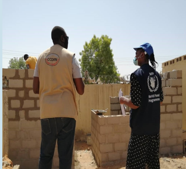
WFP official inspecting an ongoing school toilet being constructed under 2020 livelihood project in Bade

I will say CCDRN is working hard enough to meet our collective goal of SDGs 2