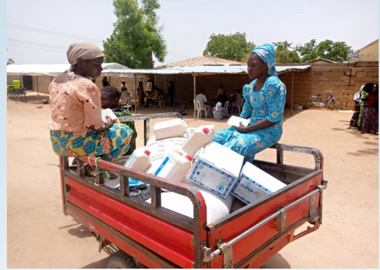
Livelihood beneficiaries set to cart away food items