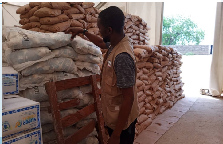
Stock Check being carried out by CCDRN official ahead of food distribution to livelihood beneficiaries in Madagali,

at the entry point, a hand wash area was provided and the temperature of beneficiaries was checked. The beneficiaries then proceed to the crowd control area where sensitization on their entitlement and COVID-19 takes place. The team ensures social distancing is maintained at the crowd control area. From the crowd control area, beneficiaries proceed to the verification point where their token is verified and then they proceed to the distribution point to pick their ration. The food ration for each household is already stacked at the distribution point to avoid the crowd during scooping at to make the process faster.