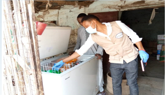
Monitoring Of Beneficiaries on IGA Activities

The five days training on Tie and dye, started on 19 th - 27 th of May, 2020, in Gujba LGA, fourteen beneficiaries were trained, while twenty beneficiaries were trained in Buni lawanti and five in Bara.