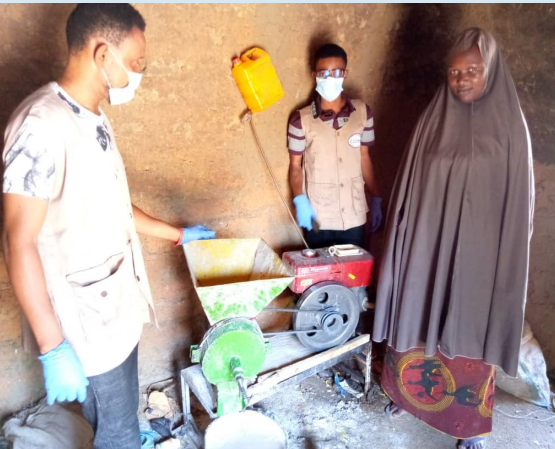
CCDRN team on IGA monitoring visit in Gujba

Building on the existing efforts to improve the livelihood and recovery process of beneficiaries through the Income Generation Activities (IGA) intervention in collaboration with World Food Programme, on 11 th – 14 th May, 2020. Centre For Community Development and Research Network (CCDRN) embarked