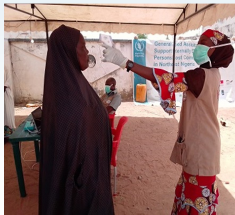
Temperature Check in line with COVID 19 preventive measures