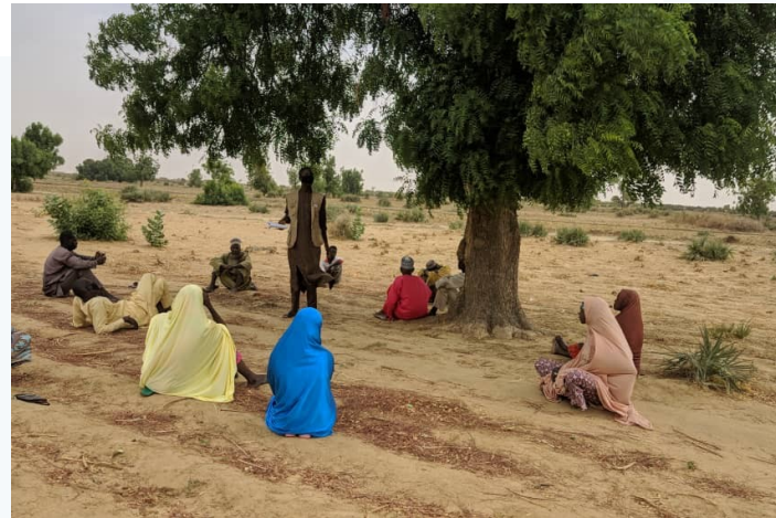
A training session for Rain fed farmers in Bade, Yobe

The training which held through the month of May 2020, was designed to build the capacity of targeted beneficiaries, empower and enable them to identify problems in the farming systems, to analyse causes and effects, to assess options and to arrive at well-informed decisions in order to prepare to take responsibility for their own future towards greater yield.