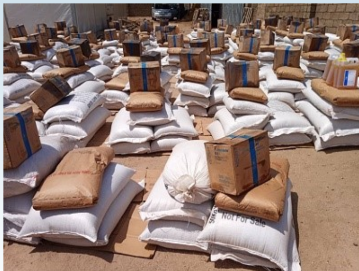
Food items strategically arranged for distribution observe all the necessary precautionary measures against the pandemic.

They received a double ration to cover for both the month of April and May. The double ration was implemented because of the fear of anticipated total Lockdown in view of the trends surrounding the outbreak of COVID 19. This is also to ensure that the beneficiaries do not go hungry while remaining at home to